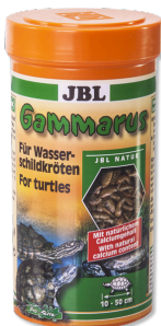
JBL Gammarus Treats for turtles from 10 to 50 cm