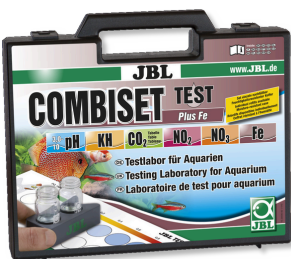
JBL Test Combi Set plus Fe Test case with most important water tests + iron test