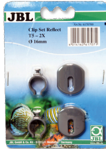
JBL SOLAR REFLECT Clip Set Holder for fluorescent tubes