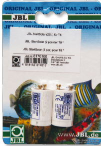
JBL Start Solar Starter for T8 fluorescent tubes