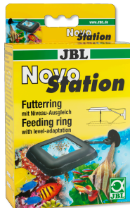
JBL NovoStation Floating feeding ring with water level adaption