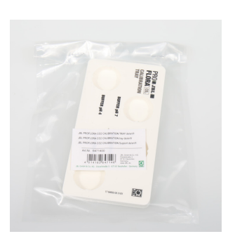
JBL PF CO2 CALIBRATION tray To keep the cuvettes upright during calibration