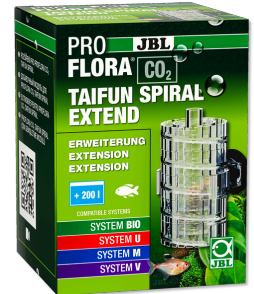
JBL PROFLORA CO2 TAIFUN SPIRAL EXTEND Extension for JBL PROFLORA CO2 TAIFUN SPIRAL 5 / 10