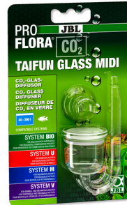
JBL PROFLORA CO2 TAIFUN GLASS Glass CO2 diffuser for freshwater tanks from 40-300 l