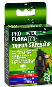
JBL PROFLORA CO2 TAIFUN SAFESTOP Water backflow protection for CO2 systems