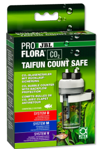
JBL PROFLORA CO2 TAIFUN COUNT SAFE CO2 bubble counter with built-in check valve