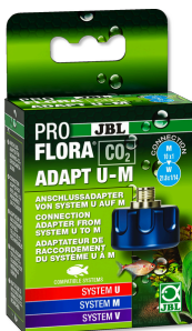
JBL PROFLORA CO2 ADAPT U - M CO2 conversion adapter disposable to refillable bottle