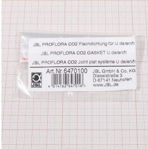
JBL PF CO2 flat gasket for u