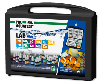
JBL PROAQUATEST LAB Marin Professional test case for marine water analysis