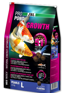
JBL PROPOND GROWTH L