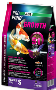
JBL PROPOND GROWTH S