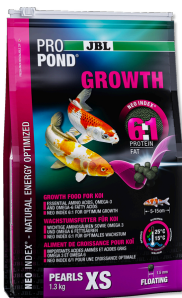
JBL PROPOND GROWTH XS