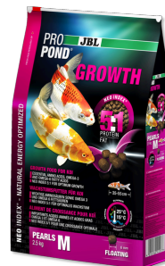
JBL PROPOND GROWTH M