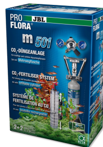
JBL PROFLORA m501 CO2 plant fertiliser system complete kit