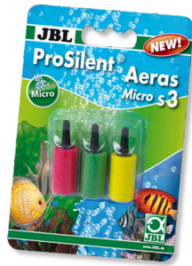
JBL ProSilent Aeras Micro S3 Air stone set for fine air bubbles in aquariums