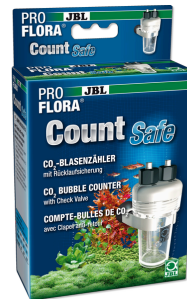
JBL PROFLORA CO2 Count Safe Bubble counter with backflow stop