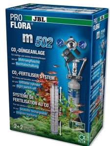
JBL PROFLORA m502 CO2 plant fertiliser system with night switch-off