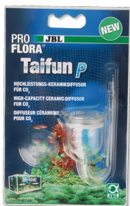
JBL PROFLORA Taifun P Mini CO2 diffuser for nano freshwater aquariums