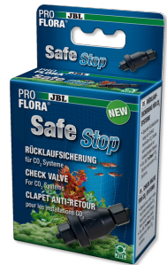
JBL PROFLORA SafeStop Water backflow stop for CO2 systems