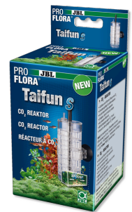
JBL PROFLORA Taifun S Extendable CO2 diffuser for small aquariums