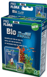
JBL PROFLORA BioRefill Refill set for bio-CO2 systems