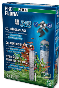
JBL PROFLORA u502 Plant fertiliser system with night switch-off