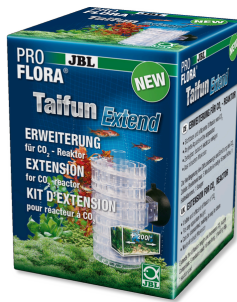
JBL PROFLORA Taifun Extend Extension for CO2 high-performance diffuser