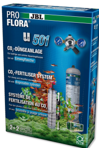
JBL PROFLORA u501 Plant fertiliser system complete kit