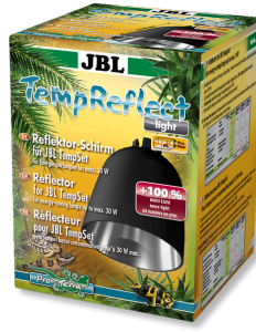
JBL TempReflect light Reflector screen for energy- saving lamps