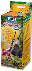
JBL TempSet connect Installation kit with connector