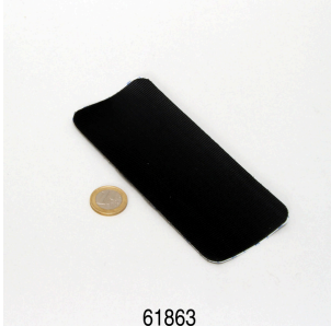
JBL Floaty Pad