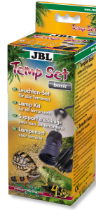
JBL TempSet basic Installation kit for lamps in terrariums