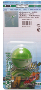
JBL Floater + AntiKink Floater with anti-kink protection for PondOxi-Set