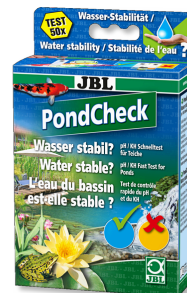
JBL PondCheck Quick test to determine the pH and KH values