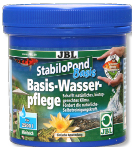
JBL StabiloPond Basis Basic care product for all garden ponds