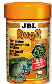
JBL Rugil Food sticks for small turtles