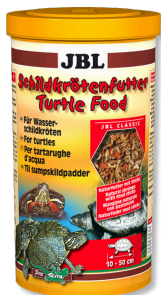
JBL Turtle Food Main food with crayfish for turtles