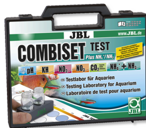
JBL Test Combi Set Plus NH4 Test case with most important water tests + NH4 test