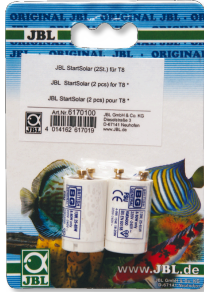
JBL Start Solar Starter for T8 fluorescent tubes