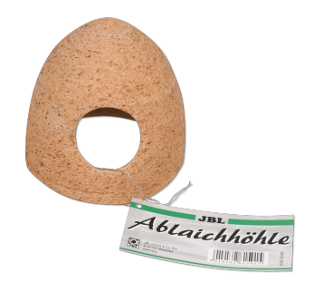
JBL Ceramic spawning cave Ceramic cave for freshwater aquariums