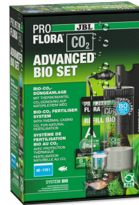
JBL PROFLORA CO2 ADVANCED BIO SET Bio-CO2 fertiliser system for freshw. tanks (40-110 l)