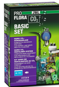
JBL PROFLORA CO2 BASIC SET V CO2 fertiliser system (NO BOTTLE!) for aquarium plants