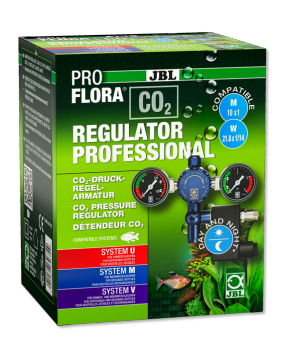
JBL PROFLORA CO2 REGULATOR PROFESSIONAL

Glass CO2 diffuser for freshwater tanks from 40-300 l