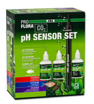
JBL PROFLORA CO2 pH SENSOR SET

pH electrode, labor. quality for almost all pH devices