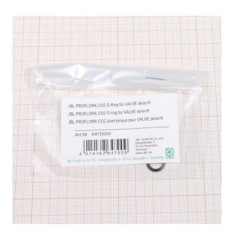
JBL PF CO2 O-ring for VALVE