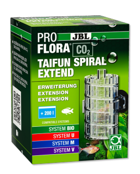
JBL PROFLORA CO2 TAIFUN SPIRAL EXTEND

Expandable CO2 reactor for freshwater aquariums