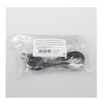
JBL PF CO2 CONTROL cable for VALVE