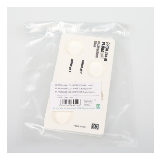
JBL PF CO2 CALIBRATION tray To keep the cuvettes upright during calibration