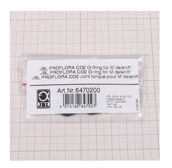
JBL PROFLORA CO2 Oring for m