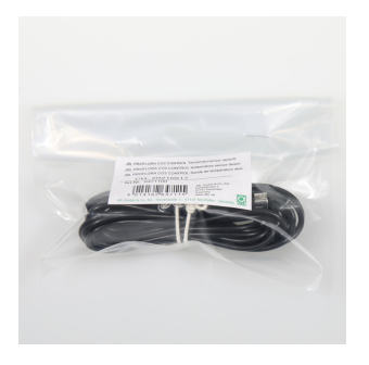
JBL PF CO2 CONTROL temperature sensor