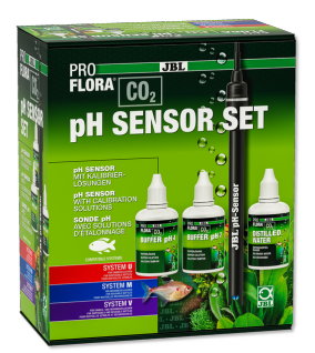
JBL PROFLORA CO2 pH SENSOR SET

pH electrode, labor. quality for almost all pH devices