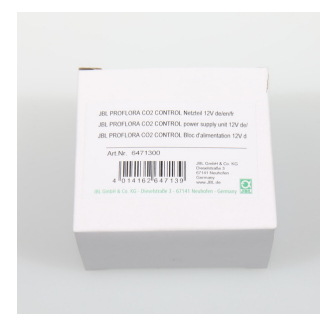
JBL PF CO2 CONTROL power supply unit 12V