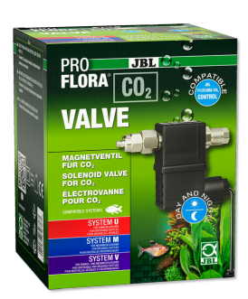
JBL PROFLORA CO2 VALVE

CO2 solenoid valve for regulated CO2 addition