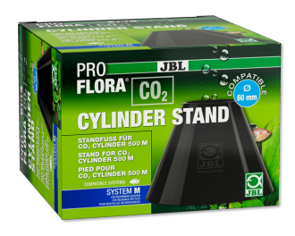
JBL PROFLORA CO2 CYLINDER STAND

Disposable storage bottle ready-filled with 1.2 kg CO2