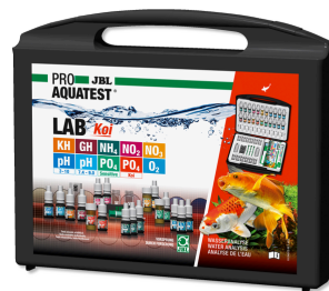
JBL PROAQUATEST LAB Koi Professional test case for koi and garden ponds