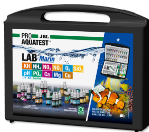
JBL PROAQUATEST LAB Marin Professional test case for marine water analysis