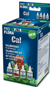
JBL PROFLORA Cal Complete kit for calibration