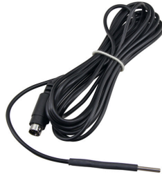
JBL pH Control temperature sensor

Rubber suction pads with clips for objects with 12 mm