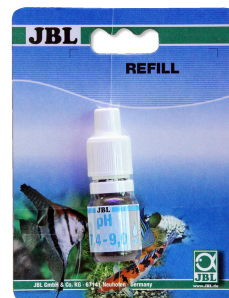
JBL pH Test 7.4-9.0 pH test in aquariums and ponds in the range 7.4-9.0