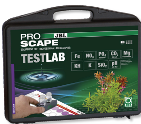
JBL Testlab ProScope Test case for water analysis in plant aquariums