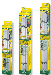
JBL SOLAR Reflect T5/ T8 - 895-1500 mm Reflector panel for fluorescent tube