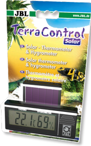
JBL TerraControl Solar Solar-powered thermometer + hygrometer for terrariums