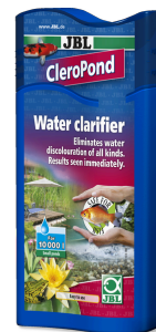
JBL CleroPond Water clarifier for the elimination of water cloudiness