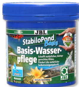
JBL StabiloPond Basis Basic care product for all garden ponds