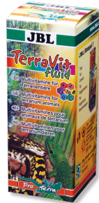
JBL TerraVit fluid Vitamins and trace elements for terrarium animals