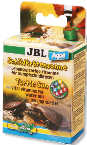
JBL Turtle Sun Aqua Vitamins for turtles and pond terrapins