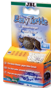
JBL EasyTurtle Special granulate to remove odours