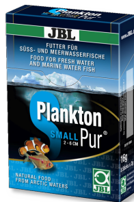
JBL PlanktonPur SMALL Treats for small aquarium fish