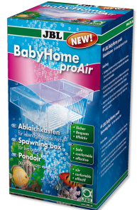
JBL BabyHome pro Air Spawning box for air stone installation