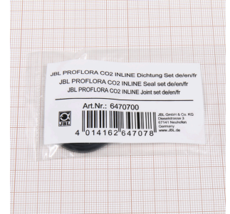
JBL PF CO2 INLINE seal set