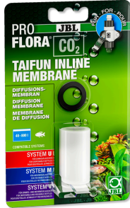
JBL PROFLORA CO2 TAIFUN INLINE MEMBRANE

Replacement diaphragm for CO2 TAIFUN INLINE diffuser