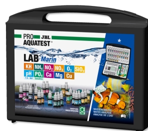
JBL PROAQUATEST LAB Marin Professional test case for marine water analysis