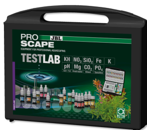
JBL PROAQUATEST LAB PROSCAPE Test case for water analysis in plant aquariums