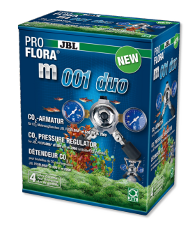
JBL PROFLORA m001 duo Fitting to reduce pressure for 2 CO2 diffusers