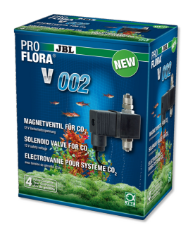
JBL PROFLORA v002 Noiseless solenoid valve