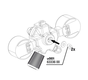
JBL ProFlora "u" flat seal