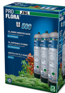
JBL PROFLORA 3 x u500 CO2 disposable storage cylinder