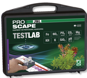
JBL Testlab ProScope Test case for water analysis in plant aquariums