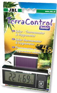
JBL TerraControl Solar Solar-powered thermometer + hygrometer for terrariums