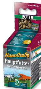
JBL NanoCrabs Main food for dwarf crayfish