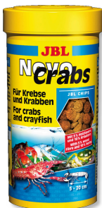
JBL NovoCrabs Main food wafers for crabs