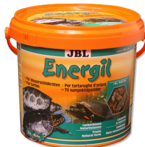
JBL Energil Main food for turtles and pond terrapins