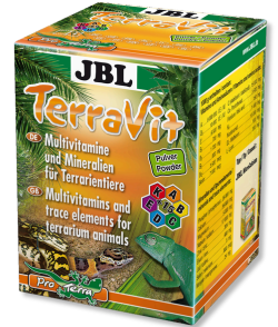
JBL TerraVit Powder Vitamins and trace elements for terrarium animals