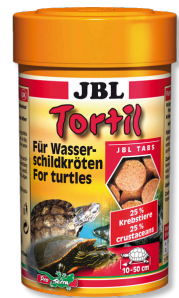
JBL Tortil Food tablets for turtles and pond terrapins