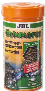
JBL Gammarus Treats for turtles from 10 to 50 cm