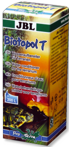
JBL Biotopol T Water conditioner for terrariums