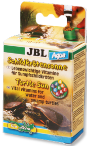
JBL Turtle Sun Aqua Vitamins for turtles and pond terrapins