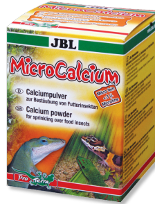
JBL MicroCalcium Mineral supplementary food for all reptiles