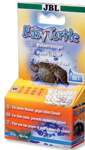
JBL EasyTurtle Special granulate to remove odours