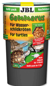
JBL Gammarus Refill pack Treats for turtles from 10 to 50 cm