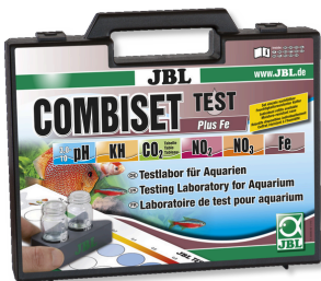
JBL Test Combi Set plus Fe Test case with most important water tests + iron test