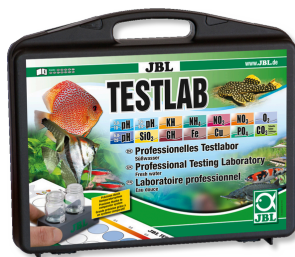
JBL Testlab Test case with 13 tests f. freshwater analysis Testlab