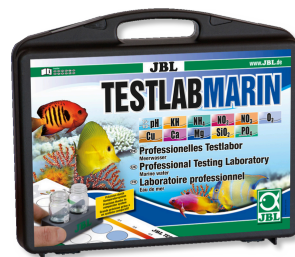
JBL Testlab Marin Professional test case for the analysis of saltwater