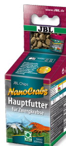
JBL NanoCrabs Main food for dwarf crayfish