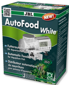
JBL AutoFood WHITE White automatic feeder for aquarium fish