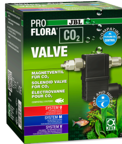
JBL PROFLORA CO2 VALVE CO2 solenoid valve for regulated CO2 addition