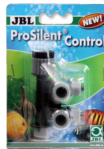
JBL ProSilent Control