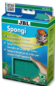
JBL Spongi Cleaning sponge for aquariums and terrariums