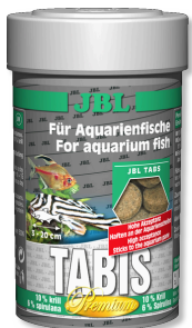
JBL Tabis Premium food tablets for freshwater and marine fish