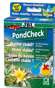
JBL PondCheck Quick test to determine the pH and KH values