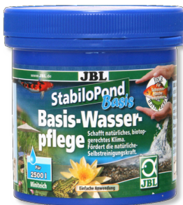
JBL StabiloPond Basis Basic care product for all garden ponds