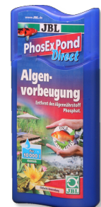
JBL PhosEX Pond Direct Phosphate remover for ponds