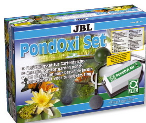
JBL PondOxi-Set Aeration set with air pump for garden ponds