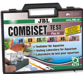
JBL Test Combi Set plus Fe Test case with most important water tests + iron test