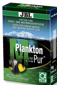
JBL PlanktonPur MEDIUM