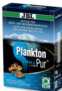
JBL PlanktonPur SMALL